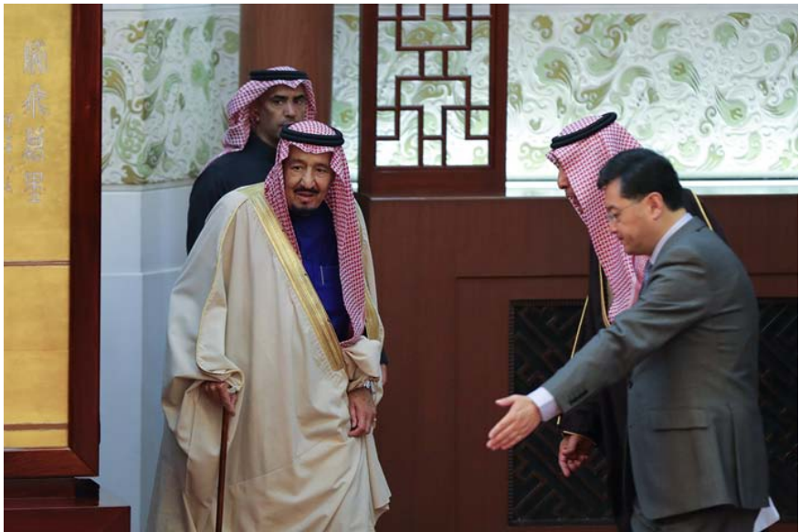
Saudi Aramco, Saudi Arabia's state-owned oil company, is reportedly in talks with China National Petroleum Corp. to resurrect a failed deal from six years ago. Above, Saudi Arabia's King Salman bin Abdul-Aziz Al Saud (center) attends a ceremony at the Great Hall of the People in Beijing on March 16, when Saudi Arabia and China signed 14 deals worth about $65 billion.

Saudi Arabia has come courting in China.